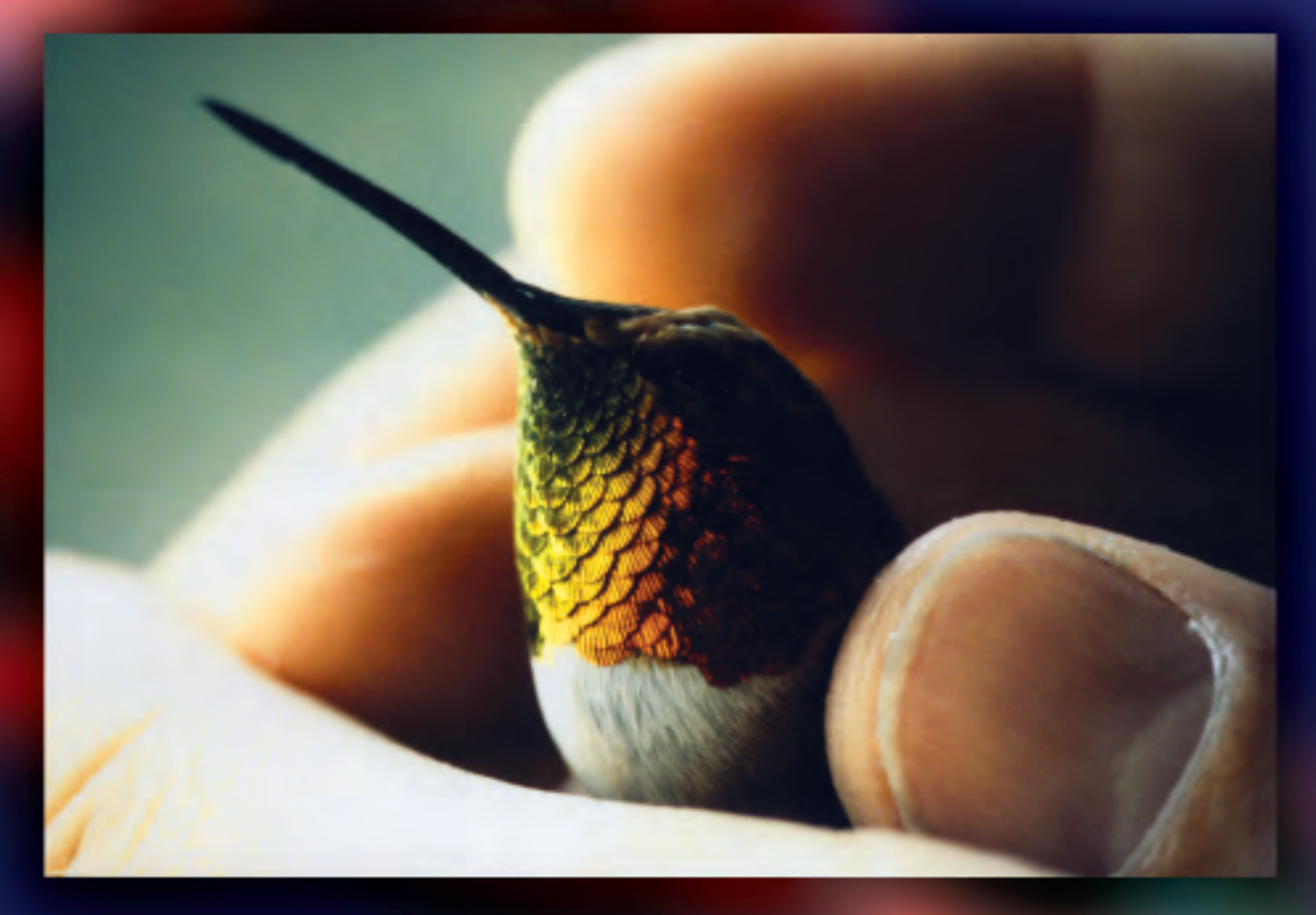
Flight of the Hummingbird

Uncovering secrets of the world's smallest birds, page 10