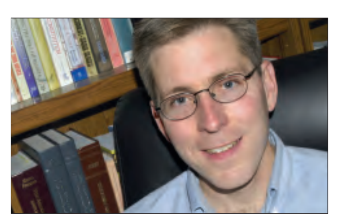
"Christians can surely agree that God calls us to help the poor, but what does this mean with respect to taxes and government programs?"

which the different Republican candidates agreed with the Christian position on a variety of issues. The rankings varied, but none came close to Pat Robertson, who agreed with God on 95 percent of the issues. His only shortcoming was his willingness to support tax increases on alcohol and tobacco — God apparently opposes all tax increases, even increases in so-called "sin taxes."