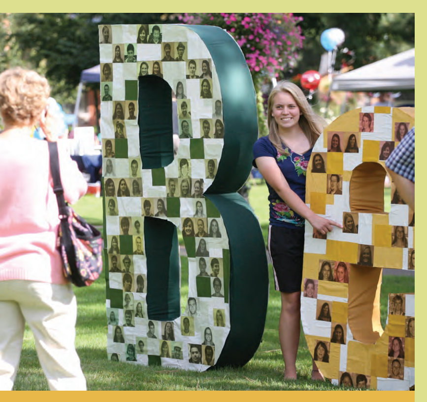
The photo of every incoming freshman - all 655 of them - was pasted on oversized "Be Known" letters in the quad during the first day of orientation.

In the last few years, the university has considered its future, particularly in light of the changing environment in higher edu-