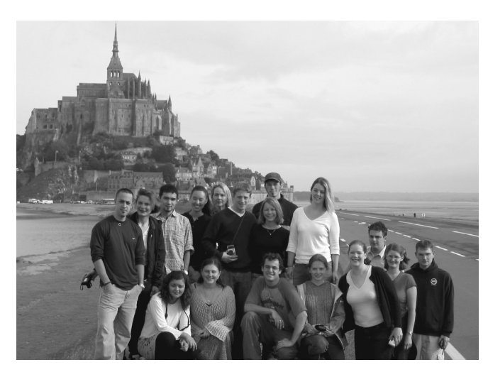
of Mont St. Michel on the Normandy coast of France. Originally a monastery built on an island surrounded by tidal flats and quicksand, St. Michel was one of the most important destinations on the

Each May, many third-year students at George Fox end their school year with a threeweek overseas study course. Started in 1987, the university's Juniors Abroad program has sent out nearly 100 of these trips, reaching every inhabited continent. This year, nearly 160 students traveled on eight trips to Europe, Central America, and Australia.