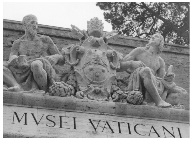
George Fox students viewed Mediterranean antiquities at the Vatican Museum and took part in a mass audience with the Pope. When the George Fox visitors were announced, the Pope acknowledged them with a wink and wave.