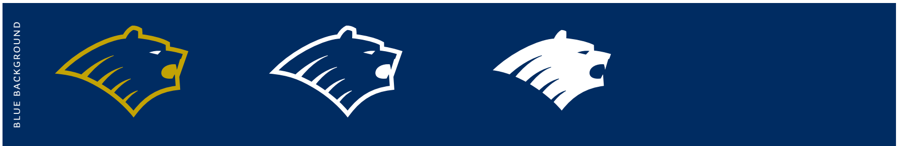
Blue and gold