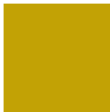
Bruin Old Gold