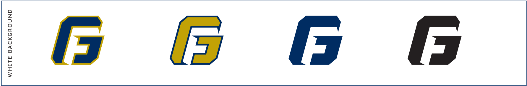
Blue with gold outline