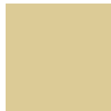
Nike Vegas Gold

Nike apparel and uniforms have “Vegas Gold” as their gold color option. It is much lighter than the Bruin gold, so much so that the marketing team refers to it as “sand,” since it doesn’t really look gold. We strongly discourage specifying Vegas Gold since it doesn’t match our gold. It is especially important not to use Vegas Gold on white, since it can completely blend into the white in some lights. A few years ago one of our teams discovered this when they had white uniforms with Vegas Gold numbers: the numbers proved to be so hard to read that the NCAA made them modify the uniforms.