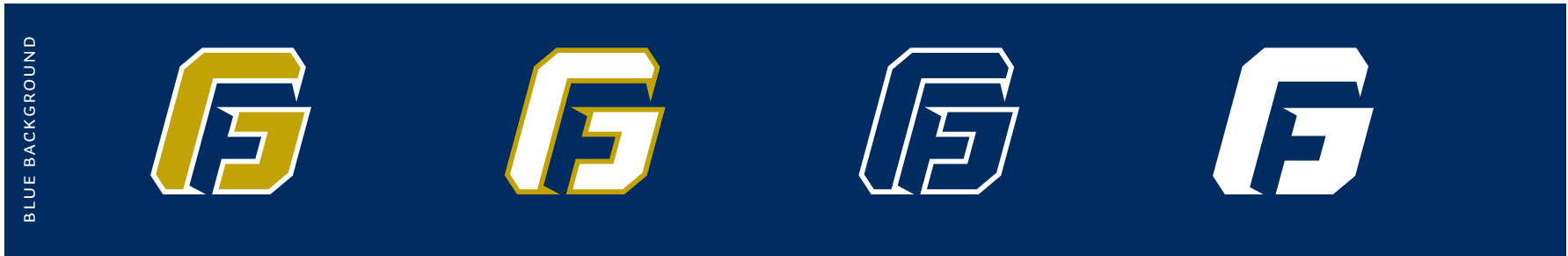
Gold with white outline