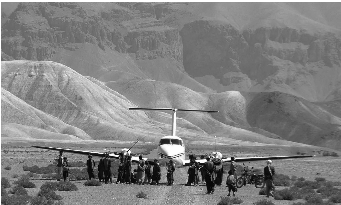
An Air Serv plane loaded with relief and development supplies and personnel is met by a group of Afghan villagers in Central Afghanistan.